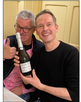
He played his cards right!

together, it is a great night out that raises important funds for our Parish Hall maintenance