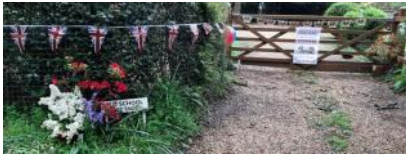
Hilary created a red, white and blue flower display set off with bunting, crowns and a royal tea towel for added impact.