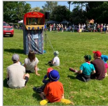
Engrossed in Punch and Judy