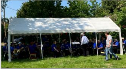
The band is in the shade, fortunately!