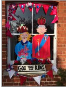
The Parish Council did their bit around the area