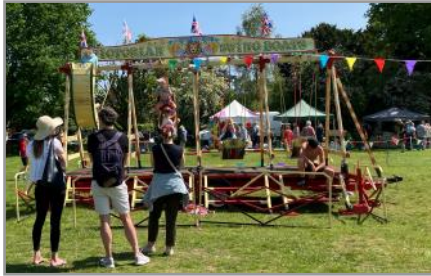
All the fun of the fair