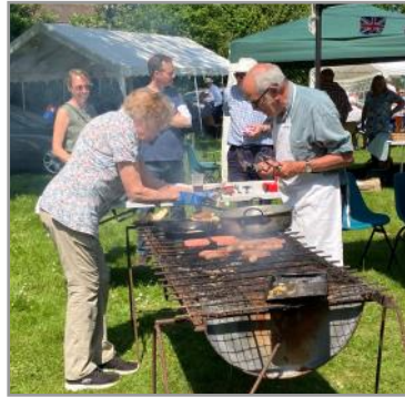
Hot work at the BBQ