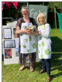
And a special mention for the WI