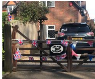
Anne got out the flags and the bunting. A special thanks to Tony for putting up the large posters!