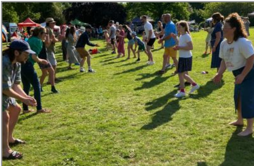
It's early days in the egg throwing