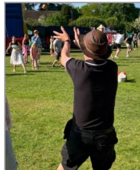
Will he catch it?