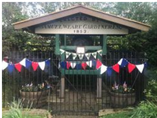
A special mention for the WI who decorated the well and the church railings.