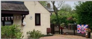
The bunting and flags were on display up and down Goring Heath Road