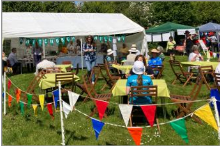
Taking a break in the tea tent