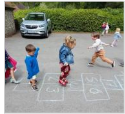
Hop, skip and jump