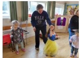
Mother's Day Diddi Dance

We celebrated Mothers Day with the children with a Mother's Day Diddi-Dance, which they thoroughly enjoyed as well as making some beautiful decorated boxes for their mummies.